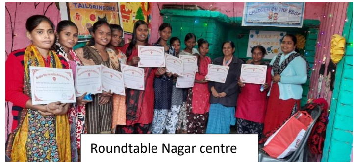
Roundtable Nagar centre

We have given them awareness class on different subjects : Health, leaderships, child marriage, atrocities on women, human trafficking, migration etc.