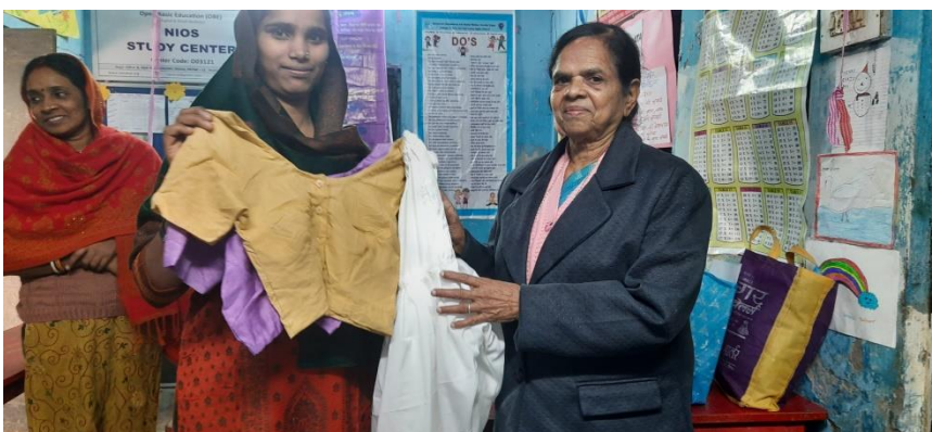
Blouse and skirt stitched