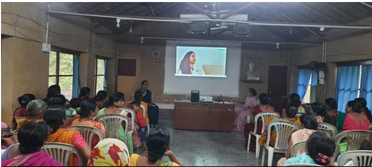
Training on communicable and non-communicable diseases by showing VIDEO

We have given them awareness class on different subjects : Health, leaderships, child marriage, atrocities on women, human trafficking, migration etc.