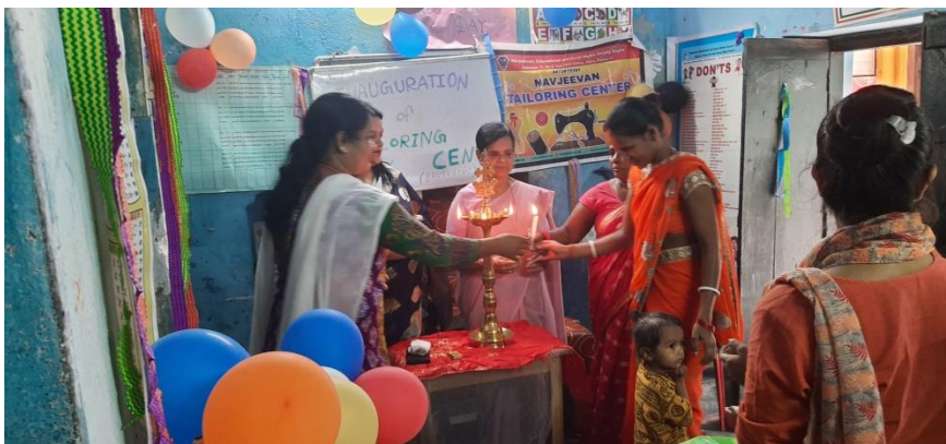
Inauguration Of the Tailoring Center Bascoti

Classes are conducted 10 am to 2 pm in one centre and 2 to 5 pm in another centre