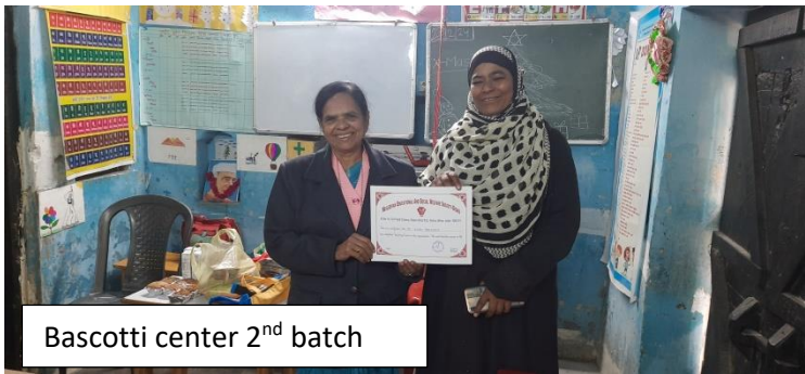
Bascotti center 2 nd batch