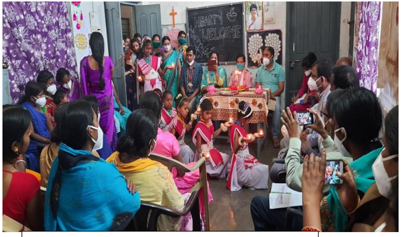
Welcome Dance by our students

Voluntary Health Association of Patna has brought 56 women from different villages to our tailoring centre as en exposure for their women to learn from our students. Our students gave them a grant welcome. They had very good interaction with our students. Our students shared their experience and also they have told us about their work. It was very enriching experience. We have learned from each other.